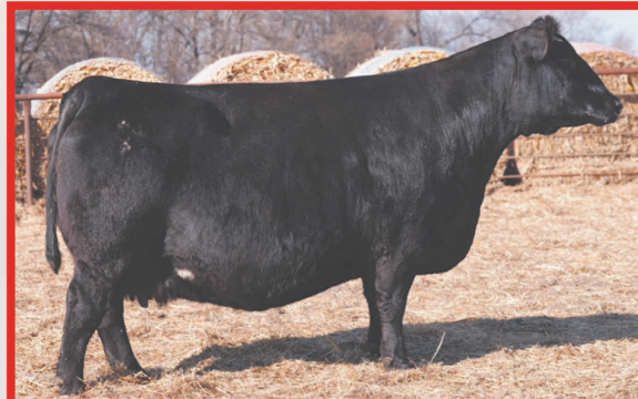
DBL Lady Upshot 001 Reg#20304111