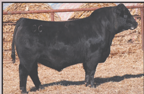
DBL Congress 5033 Reg# 21430887