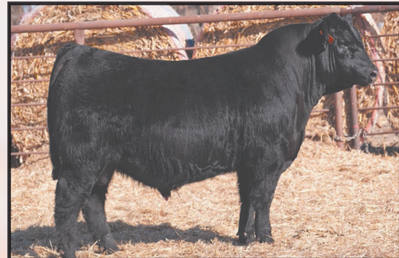
DBL Big River 5143 Reg#21430898