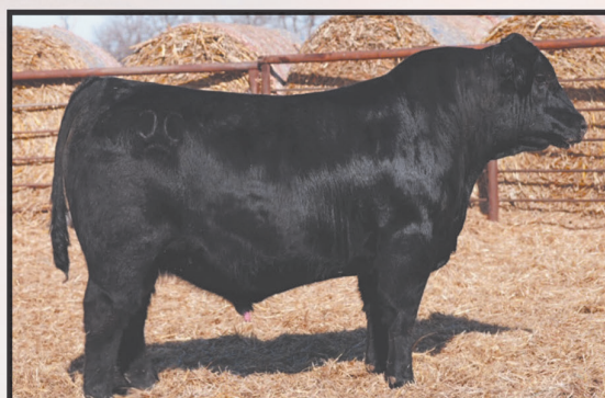
DBL Bougie 5034 Reg# 21433983