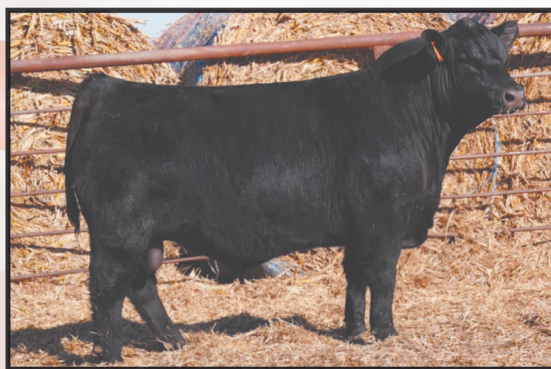
DBL Congress 5013 Reg# 21430911