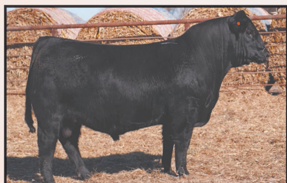
DBL Great Lakes 5046 Reg# 21430909