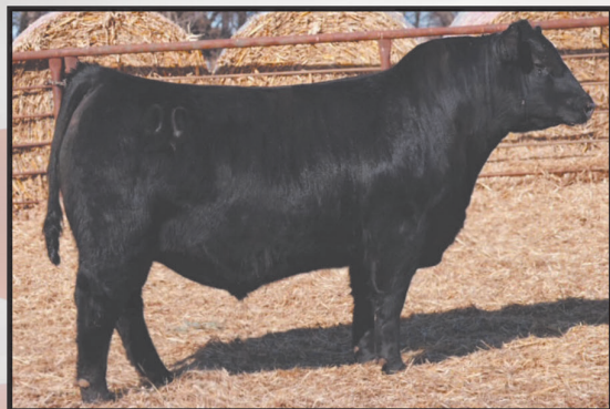
DBL Congress 5012 Reg# 21430901

Selling 100 Spring & 2 Yr old Angus Bulls, Top Donor Cow