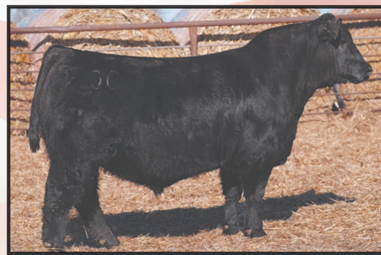
DBL Bougie 5100 Reg#21433975