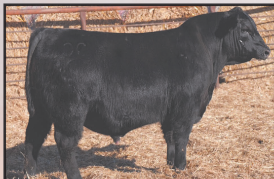
DBL Resilient 5125 Reg#21430903